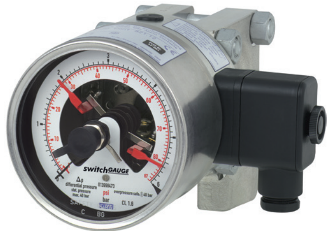
Differential pressure gauge model DPGS43HP.100 with switch contact model 821.21