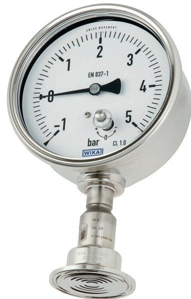
Diaphragm seal system, model DSS22P