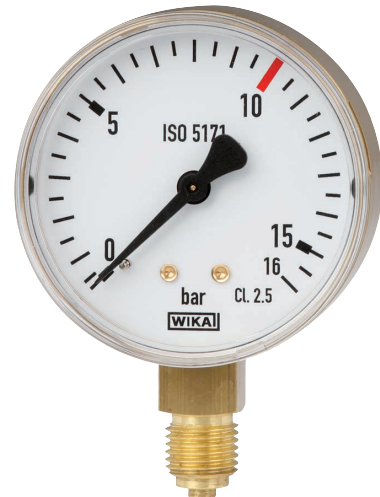
Bourdon tube pressure gauge model 111.11