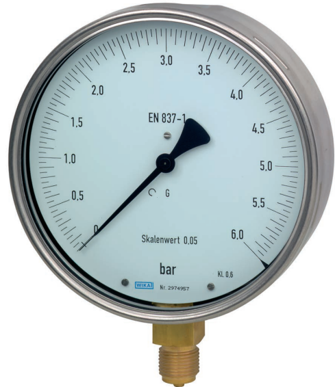
Test gauge series model 312.20